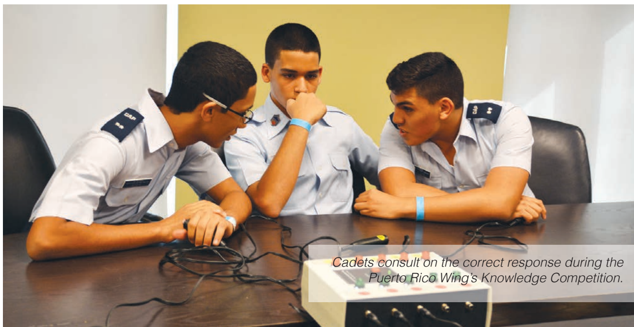
Cadets consult on the correct response during the Puerto Rico Wing's Knowledge Competition.