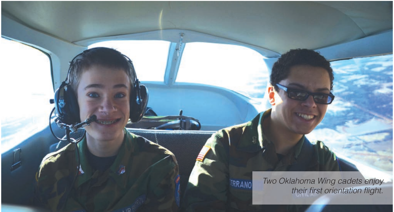
Two Oklahoma Wing cadets enjoy their first orientation flight.