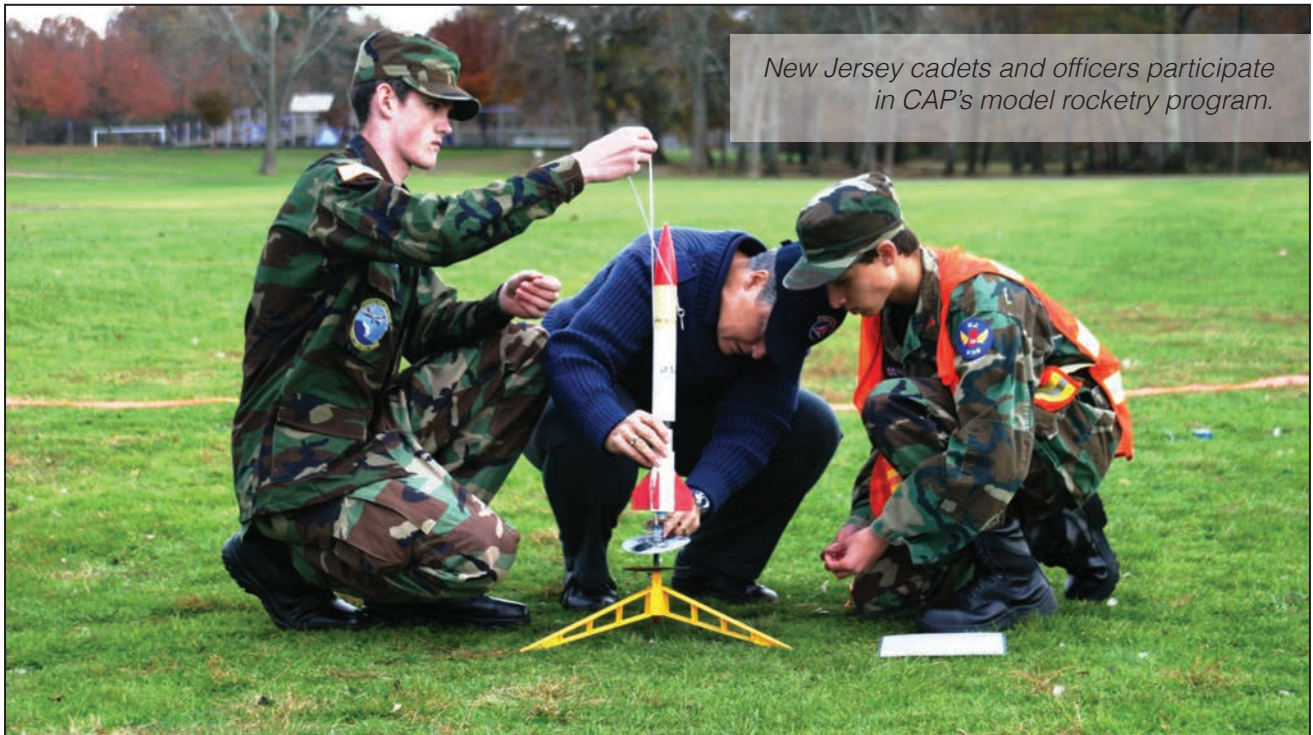
New Jersey cadets and officers participate in CAP's model rocketry program.