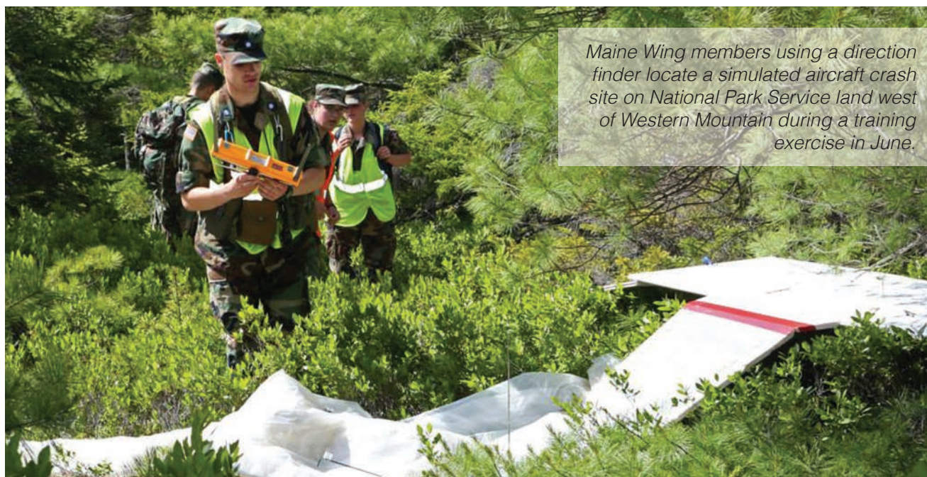
Maine Wing members using a direction finder locate a simulated aircraft crash site on National Park Service land west of Western Mountain during a training exercise in June.