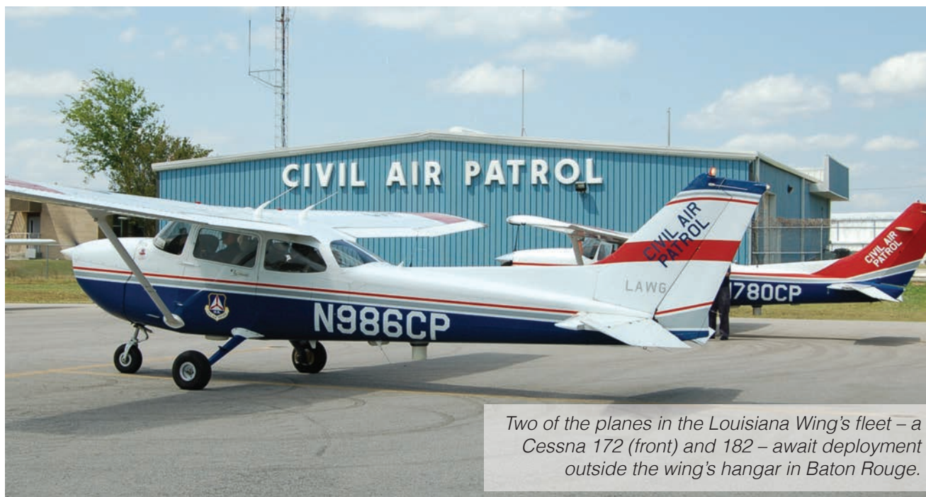
Two of the planes in the Louisiana Wing's fleet – a Cessna 172 (front) and 182 – await deployment outside the wing's hangar in Baton Rouge.