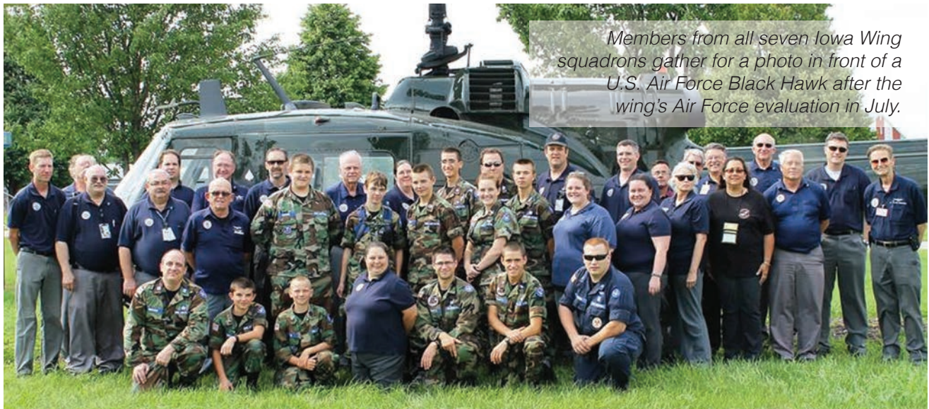
Members from all seven Iowa Wing squadrons gather for a photo in front of a U.S. Air Force Black Hawk after the wing's Air Force evaluation in July.