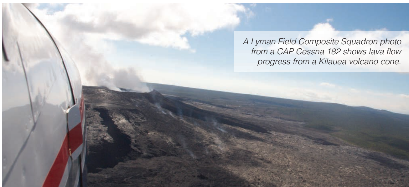
A Lyman Field Composite Squadron photo from a CAP Cessna 182 shows lava flow progress from a Kilauea volcano cone.