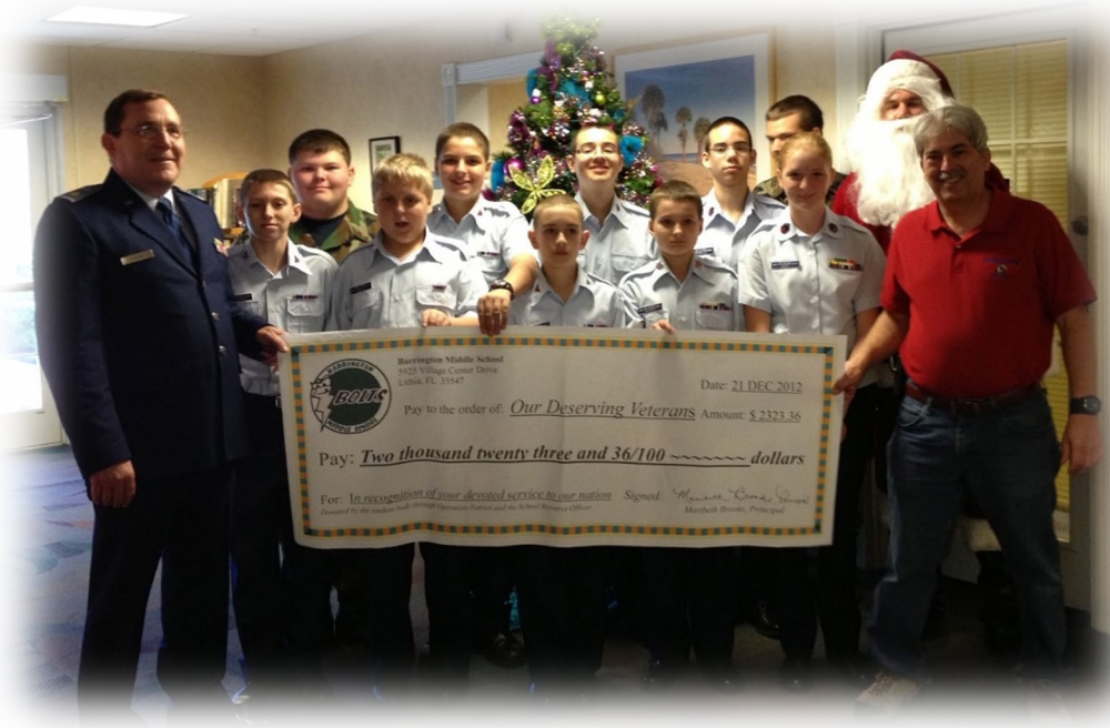
Barrington CAP cadets and ACE students delivering check (1 st year) and Christmas presents (the next year) to Veterans