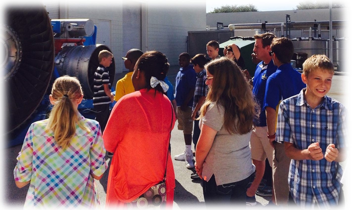
Barrington Cadets and ACE students at Embry Riddle Aeronautical University