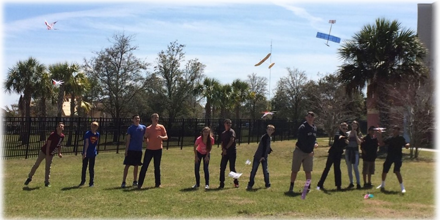
Barrington ACE students launching airplanes