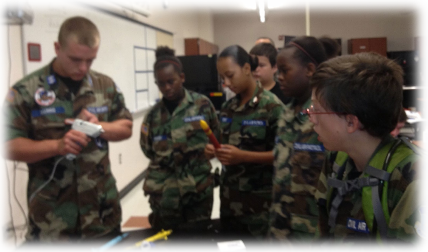
Former ACE students; now CAP cadets at Rocketry Encampment