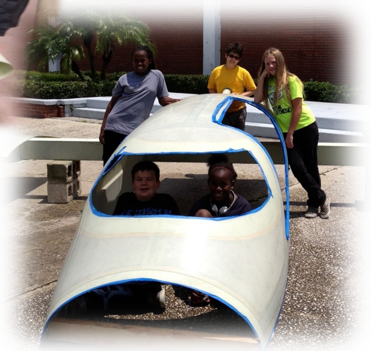
Steward ACE and CAP cadets with Build-a-Plane Project at school and at County Fair