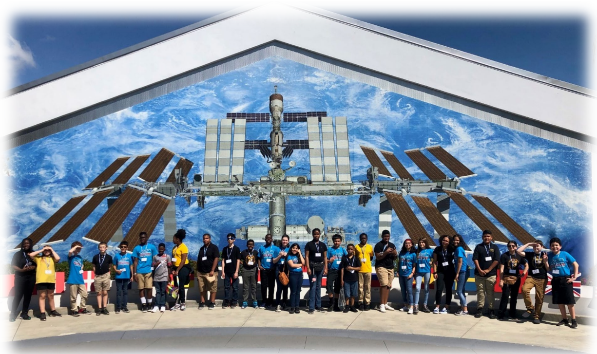
2020 Stewart Middle Magnet ACE Students at Kennedy Space Center