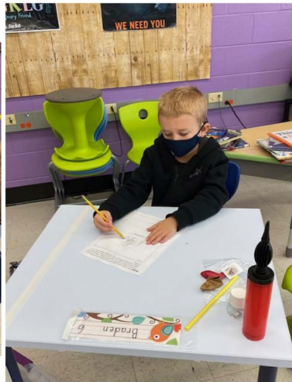
AstroTurkey: Balloon Rocket Launch