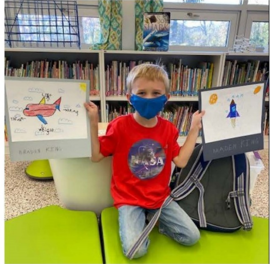
Four Forces of Flight/Rocketry