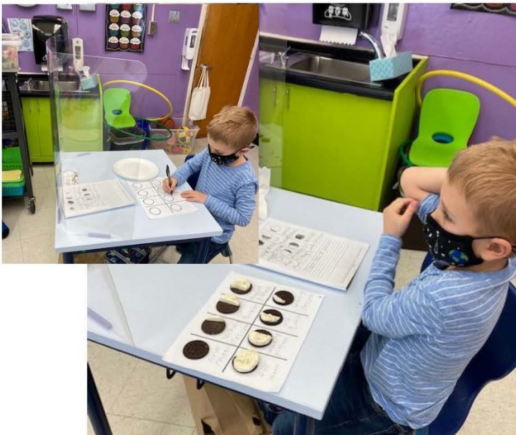
Moon Phases: OREO Style!