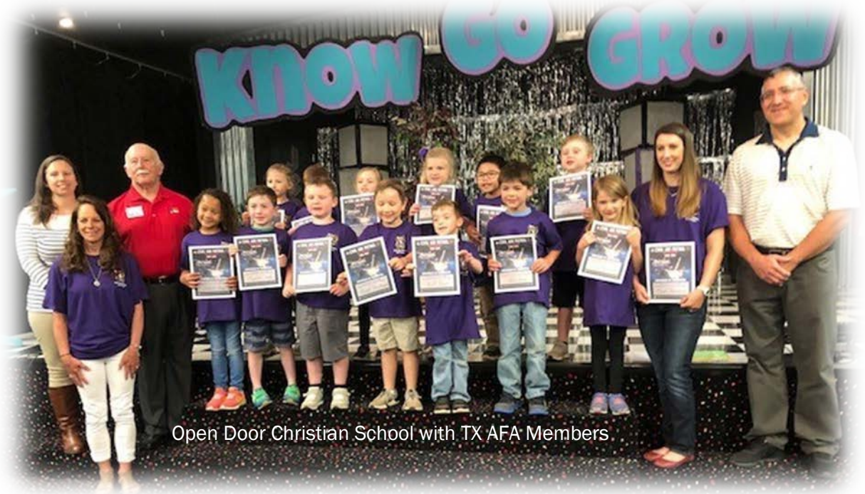
Open Door Christian School with TX AFA Members