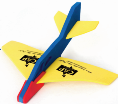
3rd Grade foam gliders