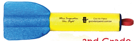
2nd Grade finger rockets