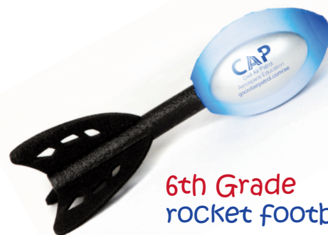
6th Grade rocket footballs