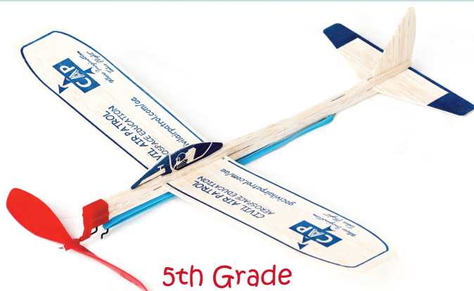
5th Grade balsa planes (powered by rubber bands)