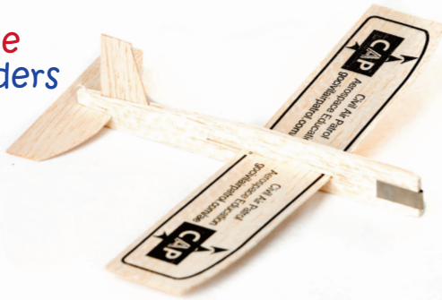
1st Grade balsa gliders