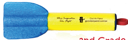
2nd Grade finger rockets