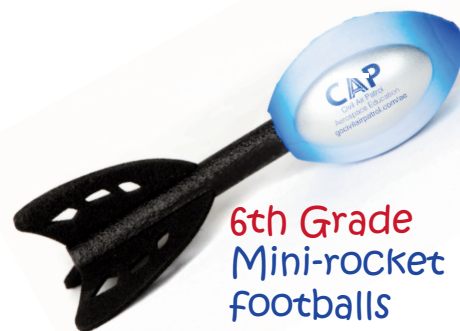
6th Grade Mini-rocket footballs