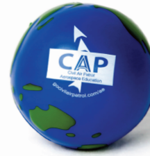
Kindergarten Earth balls

Each ACE teacher receives a free class set of grade-specific aerospace educational items. Each ACE student gets one of these fun and engaging items to bring the study of space and flight to life!