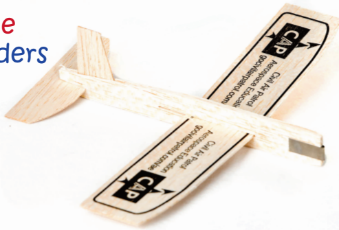
1st Grade Balsa gliders